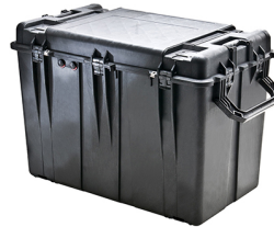
0500NF No Foam