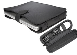
1495CBI Computer Bottom Insert