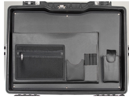
1495ALI Attache/Computer Lid Insert