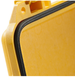
1483 Replacement O-ring