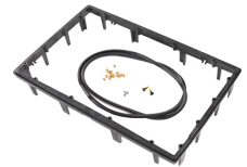
1550PF Special Application Panel Frame