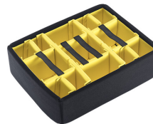
1555 Padded Divider Set