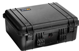
1550NF No Foam