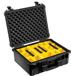
1554 With Padded Dividers