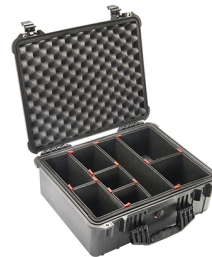
1550TP With TrekPak Divider System