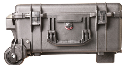
1560MNF No Foam