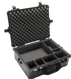
1600TP With TrekPak Divider System