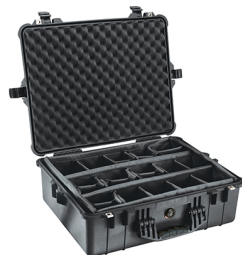
1604 With Padded Dividers