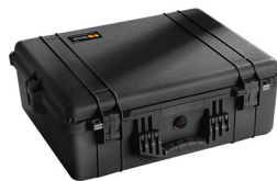
1600NF No Foam