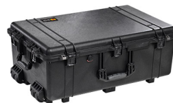
1650NF No Foam