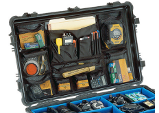
1659 Photo/Lid Organizer