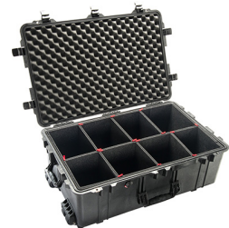
1650TP With TrekPak Divider System