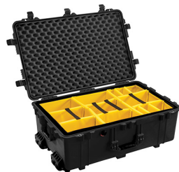
1654 With Padded Dividers