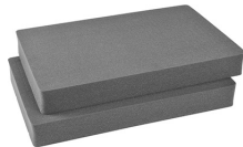
1652 Pick N Pluck™ Sections Only (set of 2)