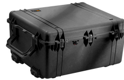
1690NF No Foam