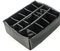
1695 Padded Divider Set