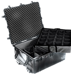
1694 With Padded Dividers