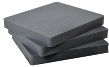
1692 Pick N Pluck™ Sections Only (set of 3)