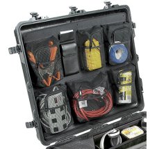
1699 Lid Organizer