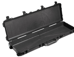
1750NF No Foam