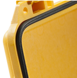
1753 Replacement O-ring