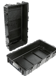
1780NF No Foam