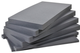
1781 6 pc. Replacement Foam Set