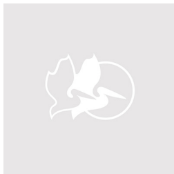
BG055TRAYRAIL Spacecase Tray