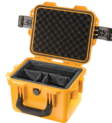
iM2075-X0002 With Padded Dividers