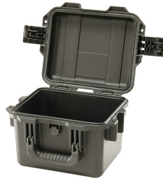
iM2075-X0000 No Foam