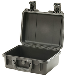
iM2100-X0000 No Foam