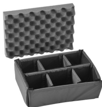
iM2100-DIV Padded Divider Set