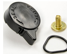
iM-VALVE-M-B Manual Purge Valve