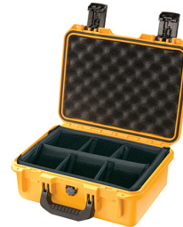
iM2100-X0002 With Padded Dividers