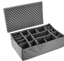
iM2950-DIV Padded Divider Set