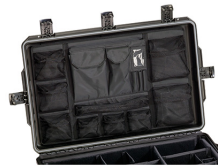
iM29XX-UTILITYORG Utility Organizer