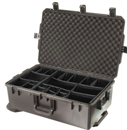
iM2950-X0002 With Padded Dividers