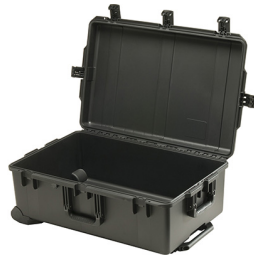
iM2950-X0000 No Foam