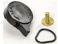
iM-VALVE-M-B Manual Purge Valve