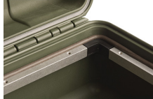
iM29XX-BEZEL Base Bezel Kit