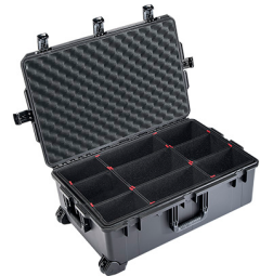
iM2950-X0006 With TrekPak Divider System