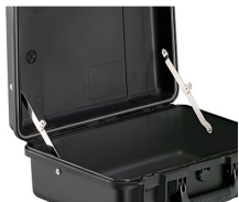
iM-LIDSTAY Lid Stay